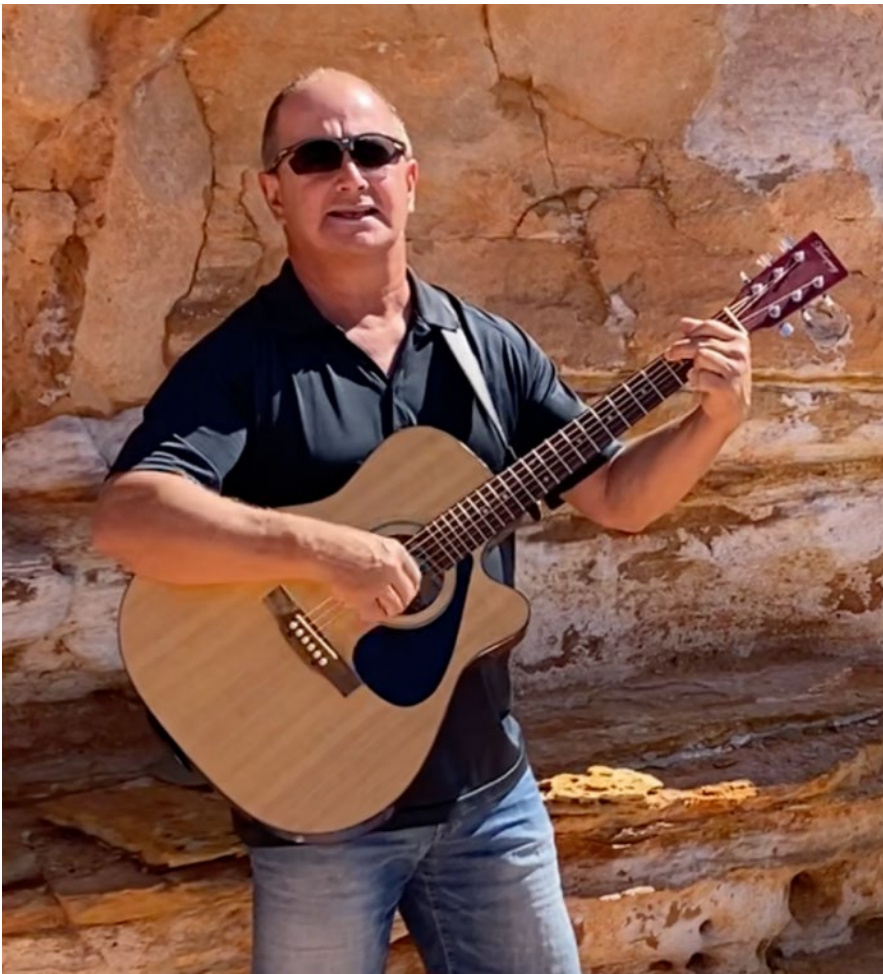
Gantheaume Point in Broome