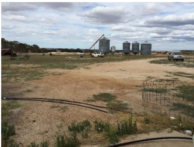
The farm down south